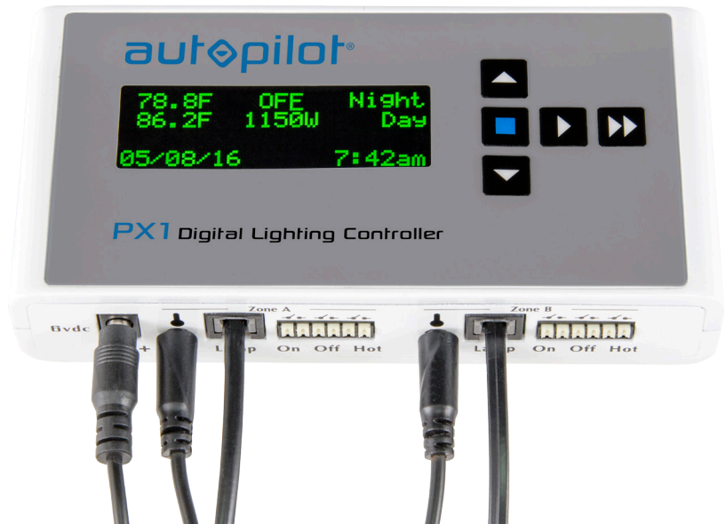
Auto pilot PX1 Digital Lighting Controller

(*RJ12 connection cables and splitter are included in the ballast box.)