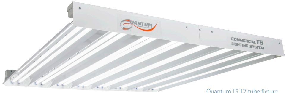
Quantum T5 12-tube fixture

Engineered with broader angles, these reflectors allow more light from the backside of the bulb to reflect onto the