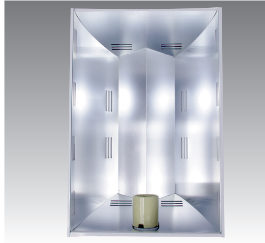
Finest German specular aluminum, 99.85% Reflectivity